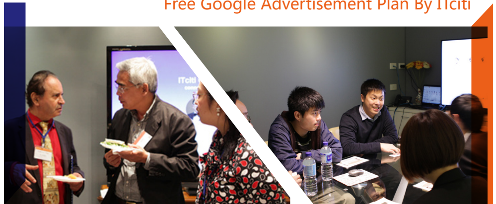
Questions and Answers Time

Free Google Advertisement Plan By ITCiti